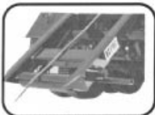
ICC FOLDING BUMPER