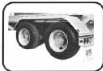
ONE PIECE FENDER