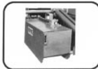
HYDRAULIC TANK SITE GAUGE